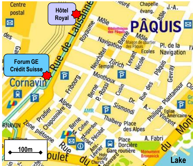
Cornavin is Geneva's Central Railway Station